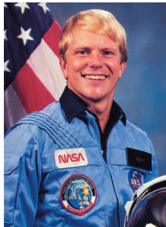
Dr. George "Pinky" Nelson